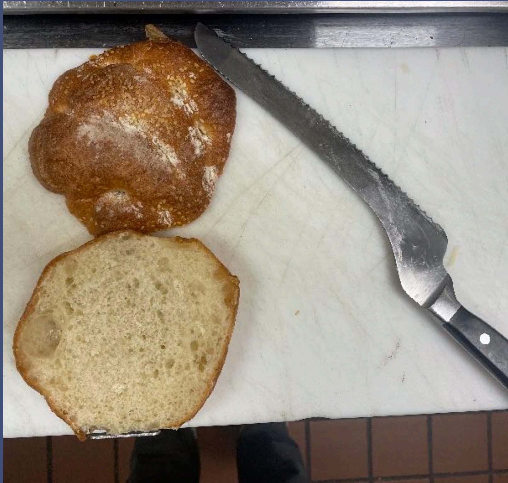
Cut Barbari bun down the middle