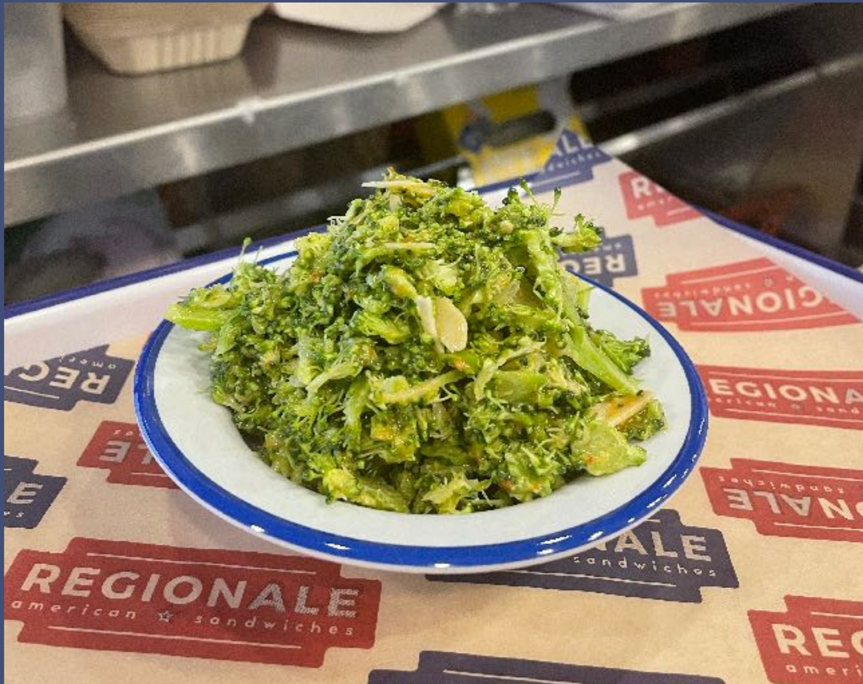
This is what the plated broccoli shred should look like.