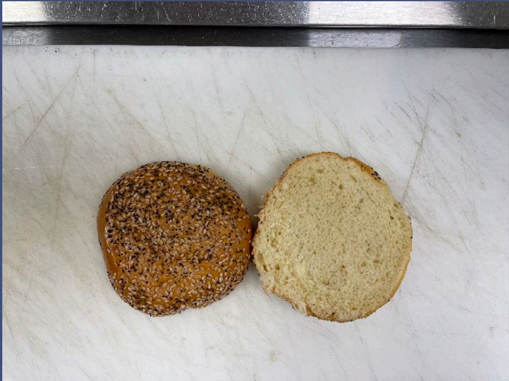
Cut potato bun to separate the top and bottom.