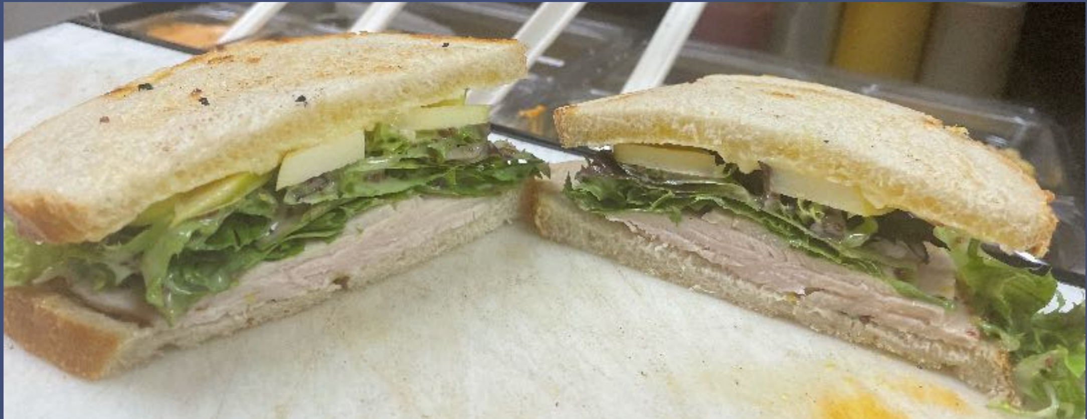
This is what the finished Vermont sandwich looks like.