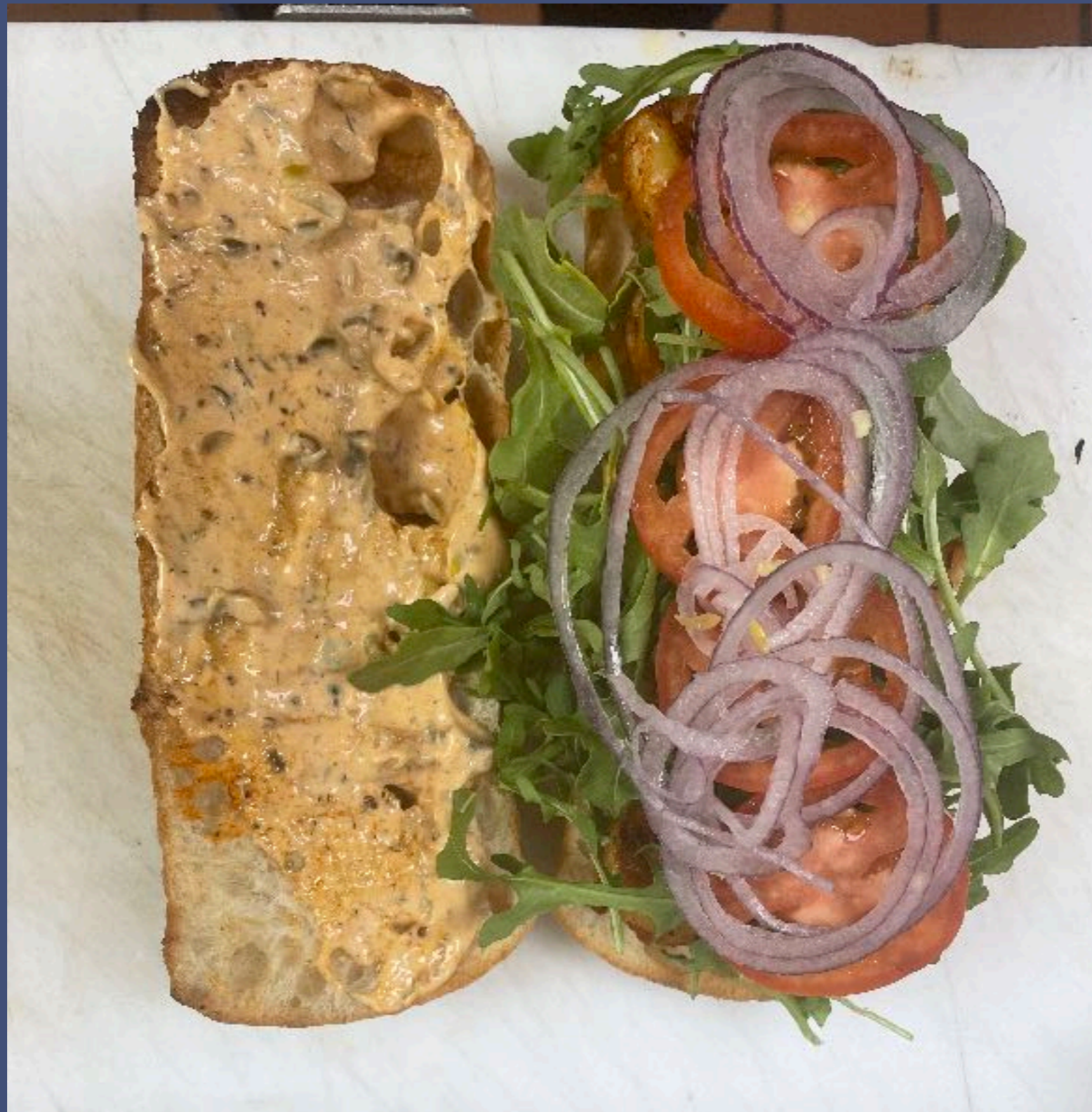
Top tomatoes with sliced red onion.